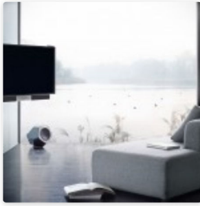
Bang & Olufsen BeoVision Avant - A 55-inch 4K TV That Literally Moves