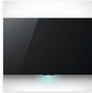
Sony X9000A Series 4K Ultra HD TV