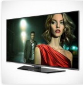
TCL 50" Edge LED 4K Ultra HD TV