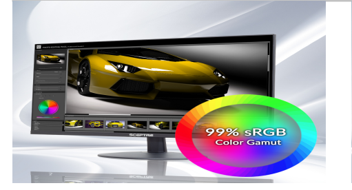
99% sRGB Color Gamut

With 99% sRGB, our display reveals an astonishing brightness and variance in red, green, and blue color across a wide gamut, providing a more defined and naturalistic display of color in every image.